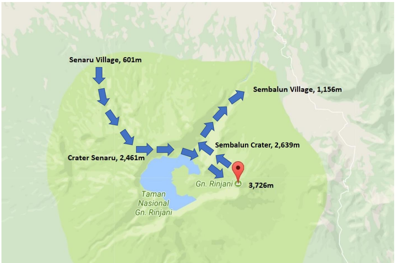
Map of Mount Rinjani Trekking

Website: www.greentrekkers.my Email: info@greentrekkers.my