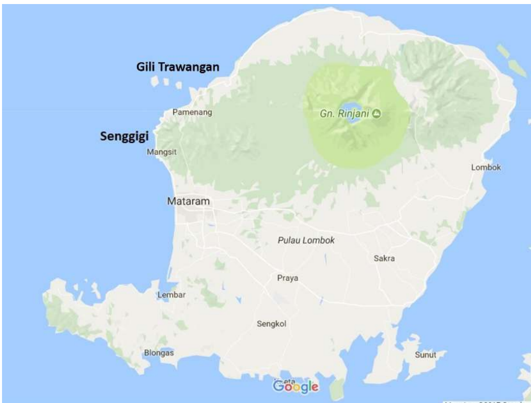
Map of Lombok Island