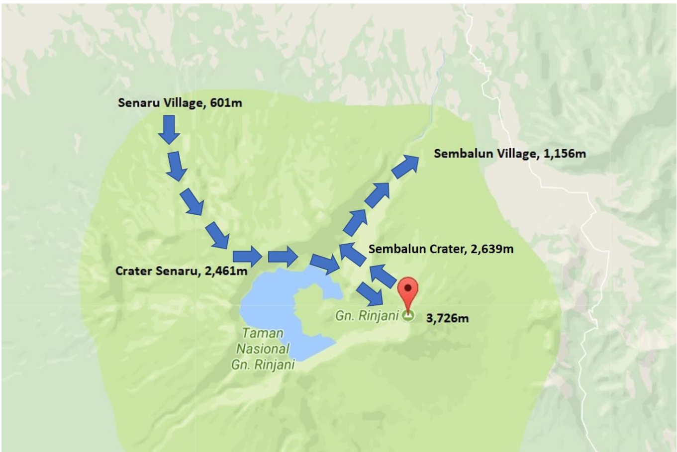
Map of Mount Rinjani Trekking

Website: www.greentrekkers.my Email: info@greentrekkers.my