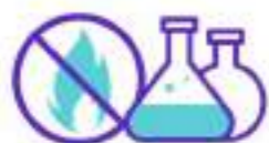
Flammable Liquids or Chemicals